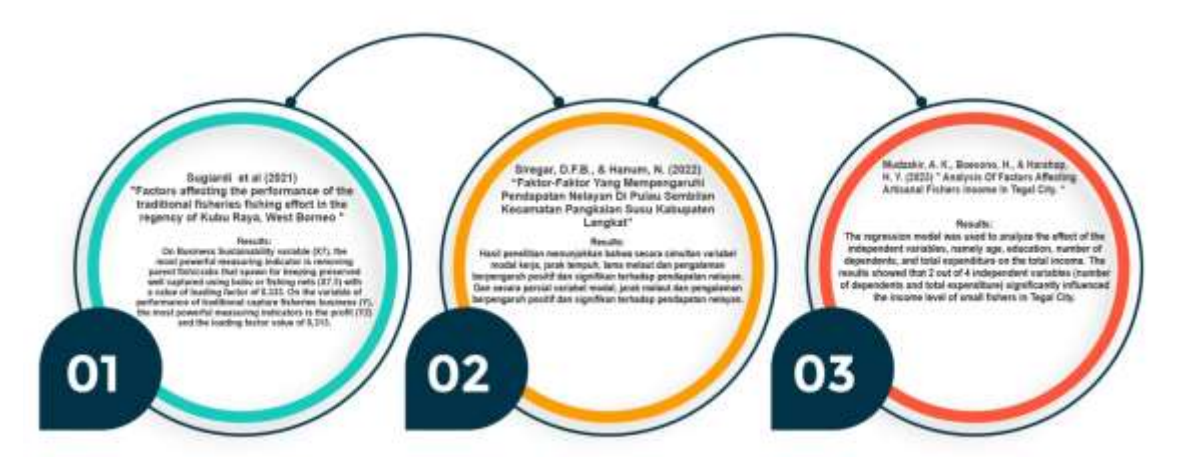
Figure 1 State Of The Art

increase in line with Indonesia's national economic growth Daryanto (2007) and will decrease over time in accordance with Indonesia's national reserves and stocks.